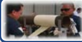
On-line Pipe Wrapping