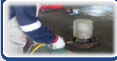
Surface Preparation Using Special EX-Proof Safety Tool