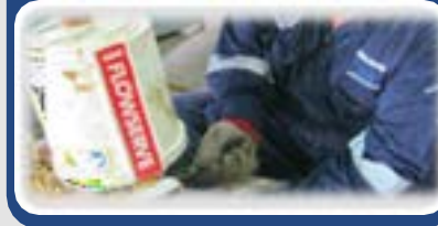
Repair Maintenance of Control Valve