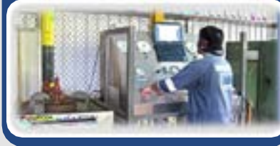
Overhaul & Calibration of Pressure and Safety Relief Valve