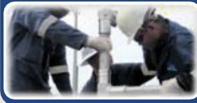
Small Bores Fitting & Commissioning