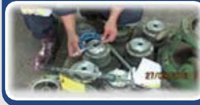
Pumps Inspection & Overhaul Repair