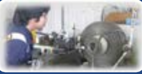
Machining & Fabrication