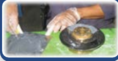
Blasting, Painting & Coating Activities